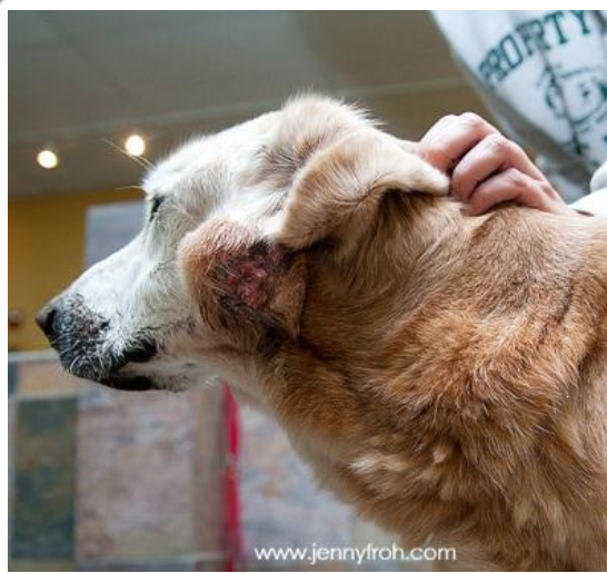
The nasty tumor on Clarence's neck